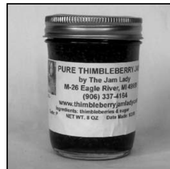
The Jam Lady