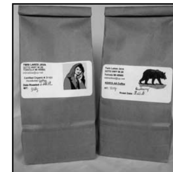
Twin Lakes Java

Prices are subject to change weekly due to fluctuations in the economy. If your total purchase amount increases by more than $3, we will notify you.