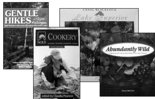
Books & Calendar