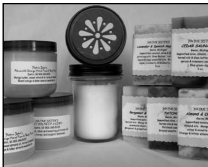
Native Sister's Soap Company