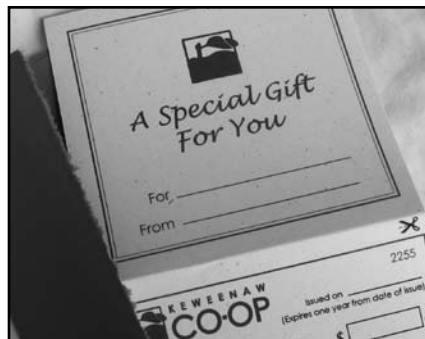
Co-op Gift Certificate

Enjoy Lake Superior's beautiful seasons with the photography of Craig Blackblock. A great addition to any room or office.