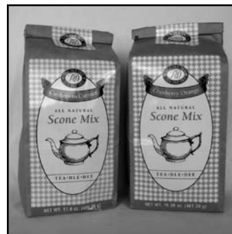
TEA · DLE · DEE