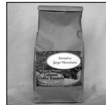
Calumet Coffee Roasters