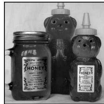
White Birch Apiary

How much will fit in a gift box? The interior of the gift box measures approximately 14 1/4" long, by 8 1/2" wide, by 4 1/2" deep. See photo on front page.