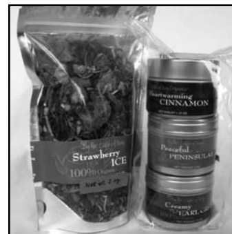
Light of Day