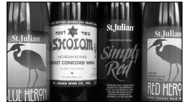
St. Julian Wine Company