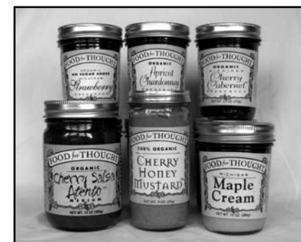
Food for Thought