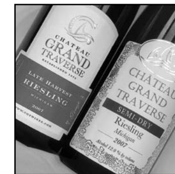
Chateau Grand Traverse